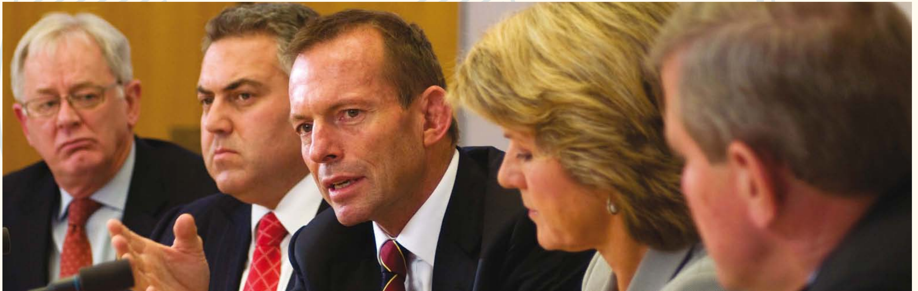
TONY ABBOTT AND THE COALITION TEAM HAVE A STRONG TRACK RECORD OF GETTING THINGS DONE IN GOVERNMENT.